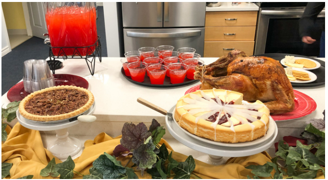
Cupcake making, nail care and Thanksgiving dinner